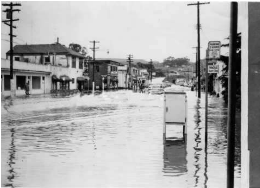
1958 Flood of Downtown Pinole

Later that year the Urban Creeks Council, the Friends of the Pinole Creek, the County and City began exploring the possibility of a grant to develop a Vision Plan for the Pinole Creek. In 2002, the California Coastal Conservancy granted $150,000 to create a Pinole Creek Watershed Vision Plan and a preliminary design for restoration of the flood control channel. The Vision Plan was created through a consensus building approach by The Restoration Design Group. Multiple mailings and public meetings were held to get community involvement. The continued public dialogue was a priority of the project and created a spirit of cooperation throughout the community and within the agencies involved.