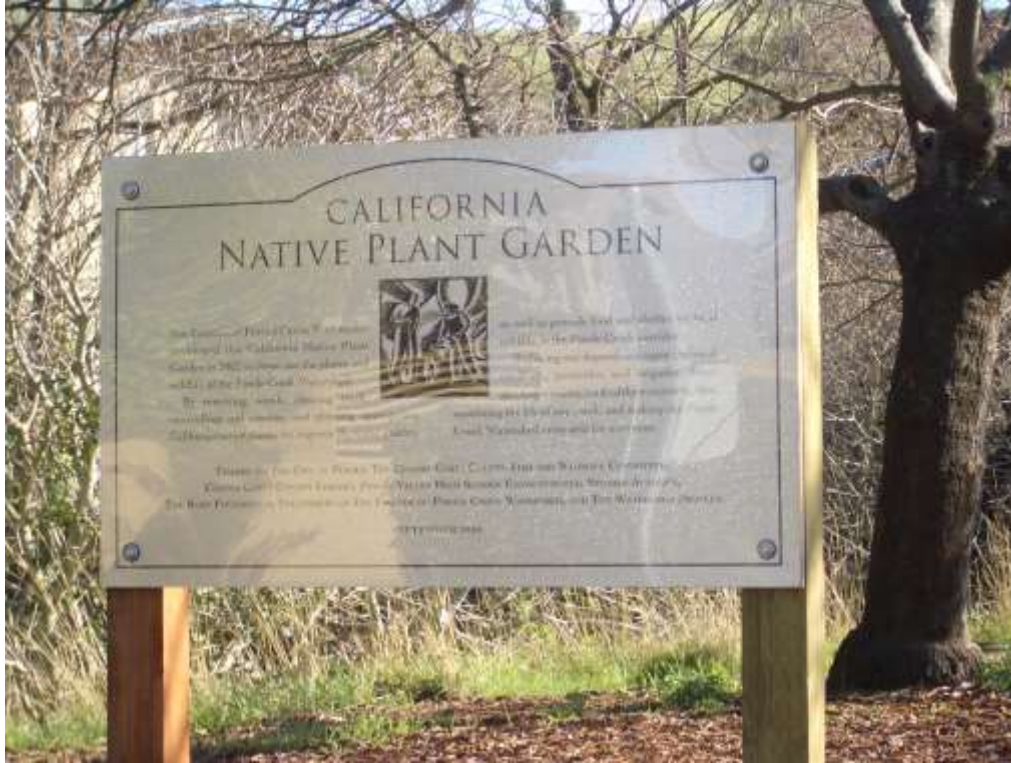
Creek Education at FOPCW Library Garden

California Native Plant Garden: FOPCW constructed a California Native Plant Garden adjacent to the Library to showcase the plants and wildlife of the Pinole Creek Watershed. The plaque placed in 2008 to commemorate the garden says it best: “By removing weeds, clearing trash, controlling soil erosion and planting appropriate California native we improve the water quality as well as provide food and shelter for local wildlife in the Pinole Corridor. Reducing our dependency upon chemical fertilizers, pesticides and irrigation water also helps maintain a healthy ecosystem thus sustaining the life of our creek, and making the Pinole Creek watershed enjoyable for everyone.”