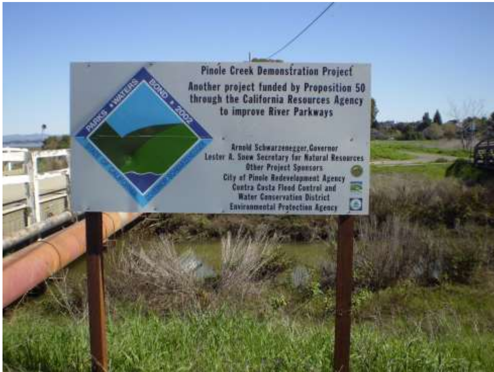
Demonstration Project Sign

Flood Management improvement is a significant area of progress for the Pinole Creek Watershed. In 2010, the City of Pinole in Partnership with the Contra Costa Flood Control District, the Restoration Design Group and the Friends of Pinole Creek Watershed and oversight from the US Army Corps of Engineers, implemented a redesign of the flood control channel below San Pablo Avenue. This has significantly reduced the risk of property damage to Pinole and Hercules properties and residents within that creek area. This project was funded by the State of California and the Federal EPA.