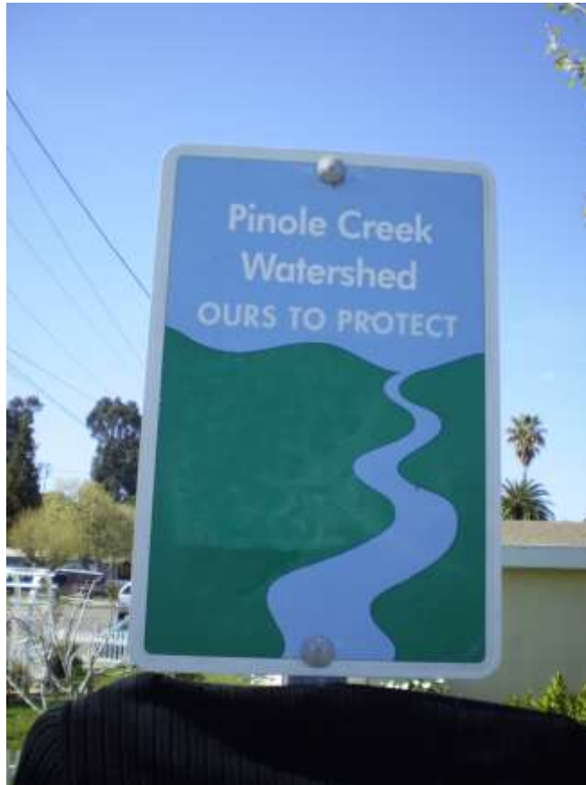
Watershed signs creekside

produced by the Contra Costa Resource Conservation District. Every storm drain in the city now has plastic emblems stating “No dumping, Drains to Bay.” Fines for illegal dumping have increased and the county is vigilant about picking up any items “accidentally” dumped.