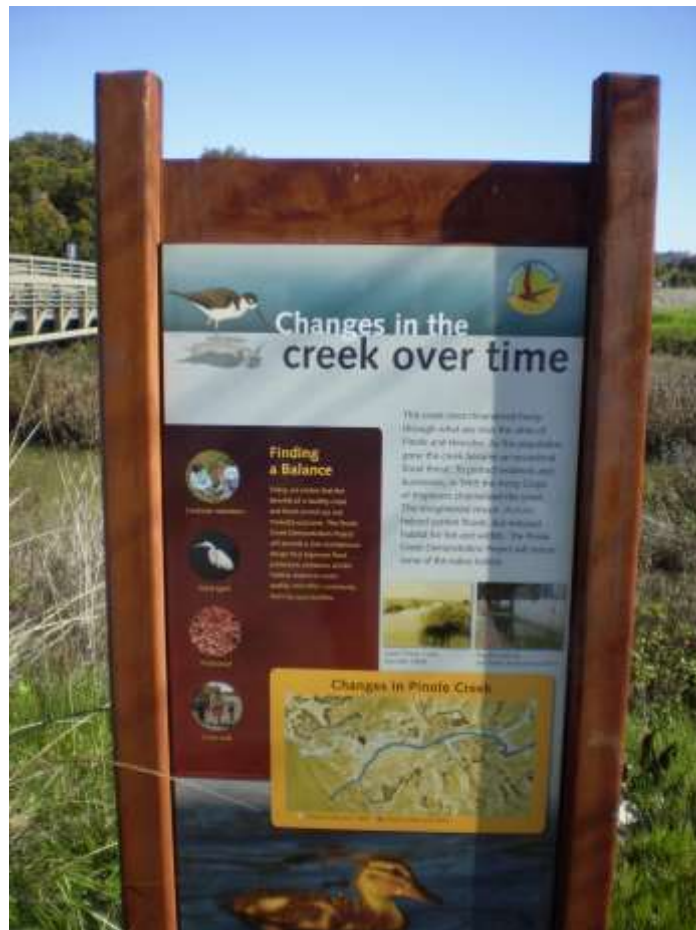
Building Creek Awareness at Demonstration Site

Pinole Creek Demonstration Project: The State River Parkway's Grant for the Demonstration Project included funding for an interpretive element. A graphic design firm was hired to work with the FOPCW to develop interpretive panels to provide key information on the history and ecology of the project area. The FOPCW is also under contract to work with the Restoration Design Group for the City of Pinole to perform the vegetation and channel monitoring for 5 years as required by the various regulatory agencies which permitted the project.