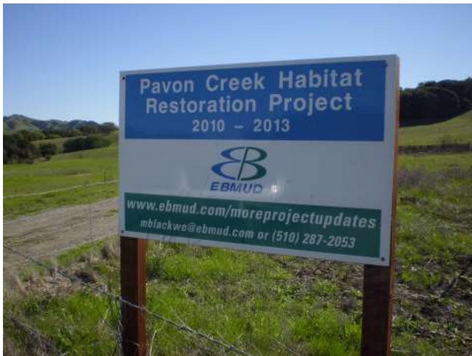
Pavon Creek Sign

Pavon Creek Restoration Project: In 2002, the Contra Costa Resource Conservation District hired the San Francisco Institute to work with them on studying the excessive sediment issue in Pinole Creek. They subsequently published the Pinole Creek Watershed Sediment Source Assessment and the Pavon Creeks Sediment Source Assessment which revealed that the majority of sediment in Pinole Creek was coming from the four Pavon Creeks tributaries. In the winter of 2012, EBMUD completed the Pavon Creeks Wetlands project. With the seismic upgrade of the nearby San Pablo Dam, habitat needed to be recreated for several species. The project created a sediment detention basin and several red legged frog ponds. These ponds were planted with native plants and created new seasonal wetlands. These wetlands now provide habitat for a number of sensitive species including two red legged frog breeding ponds. This project has greatly reduced the erosion and sediment in this area. In the next few years, wetland plants will develop and native wildlife will thrive at the site. Come see this dramatic transformation!