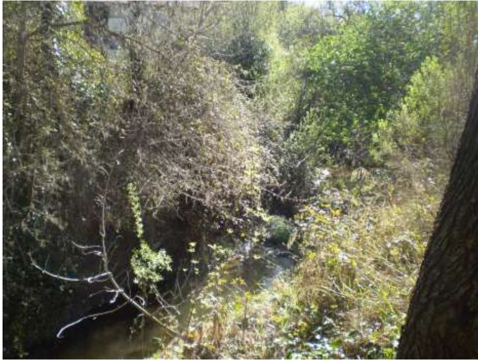
Pinole Creek in its Natural State!

Social consideration and Recreation is important to the Vision Plan. The plan calls for consensus, and a cooperative spirit within the Pinole to create a lifestyle that everyone in Pinole can enjoy. The natural beauty of the Creek can be part of a recreation destination and the city and a respite for all.